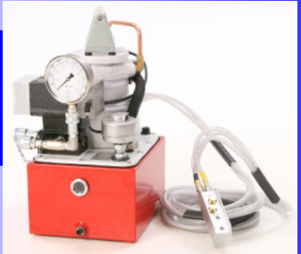
Pneumatic & Electric Pumps