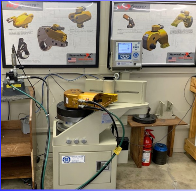
40K Hydraulic Calibration Stand